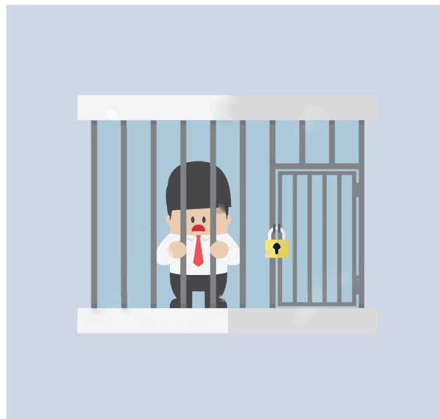
DON'T GET LURED BY HIGH RETURN SCHEMES DO YOUR DUE DILIGENCE